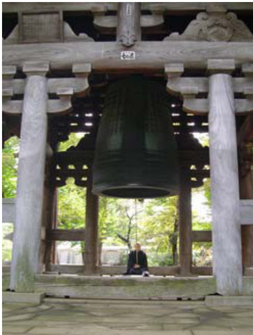
The great bell at Sojiji Adrien Bain

Greetings! More news re the WSF 2008 and all the usual sundry bits and pieces.