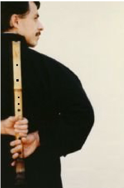
A flute with no holes...