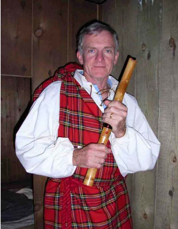
Holding a Bass Shakuchanter .....