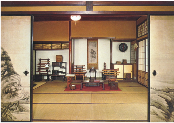
A practice room!