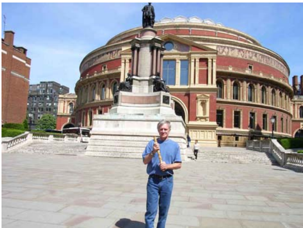
Lurking outside Albert Hall in London