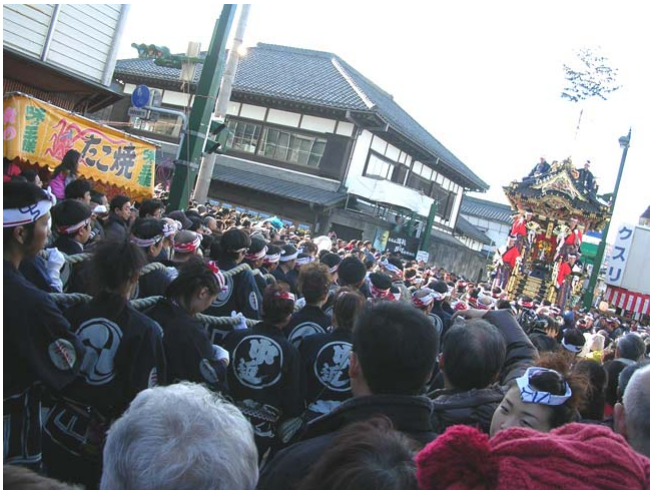
After sake - photographer?