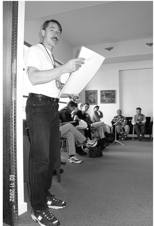
The Master says 'I don't see enough Pain!'