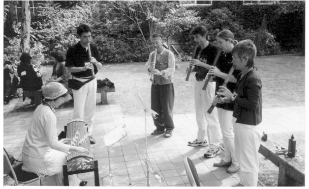
What were they practicing?