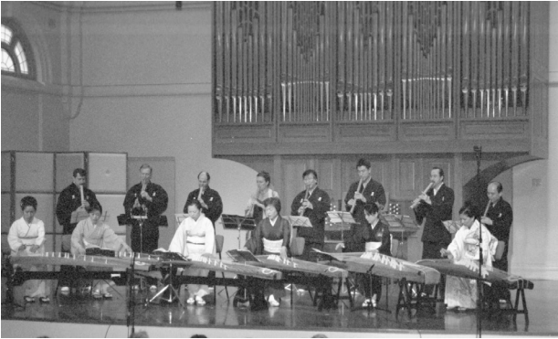
The Masters in Concert.