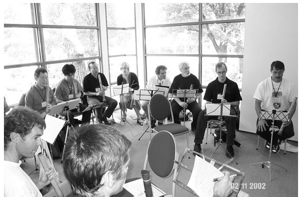
One of the Workshops